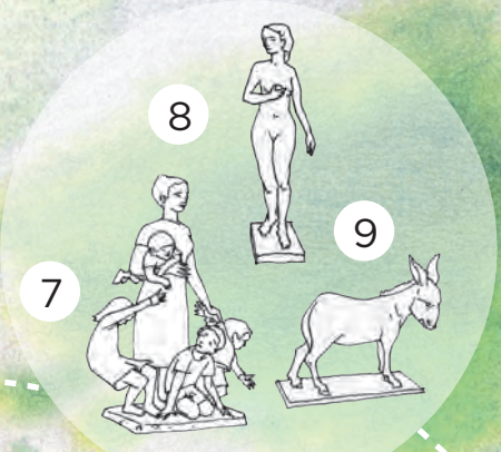
7 8 9 HUG Cantonal hospital Hôpital / Claparède / Augustins