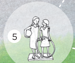
5 BERTRAND PARK Peschier