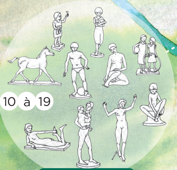
10 à 19 TROINEX TOWN HALL Troinex Mairie