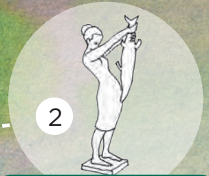
2 CROPETTES PARK Cornavin / Poste