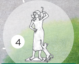
4 THÔNEX Trois-Chêne hospital Hôpital des Trois-Chêne