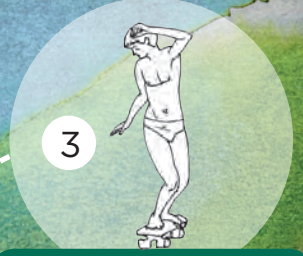
3 COLOGNY Manoir School Cologny-Temple